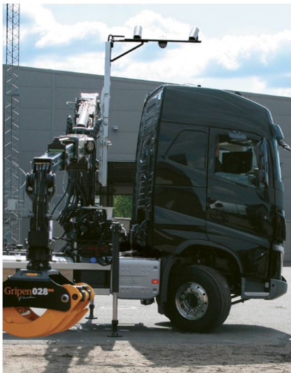
The stereo-cameras placed on the crane gives a deep-vision to the picture, and visualizes the position of the grapple in real time.